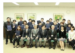
Fig.2 Activities of the dementia care instructors